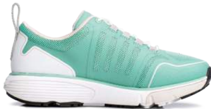
Seafoam Green 10325