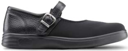
Black Lycra** 4415