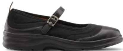
Black Lycra** 2315

Style: Mary Jane Upper: Leather Interior: Leather Outsole: EVA Closure: Hook-and-loop Sizes: M, W (4-11, 12), XW (4-11)