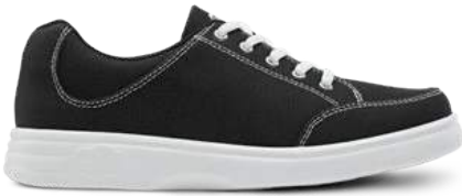
Midnight (black/white) 0250