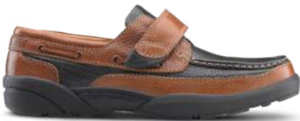
Black/Brown Multi 8660